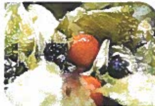
JAMM AQUINO / 2012

FREE LUNCH Kids who need a balanced meal during summer break have options at parks and schools >> D3